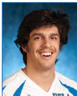
Career Highs Digs: 16