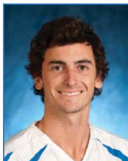
Career Highs Digs: 14