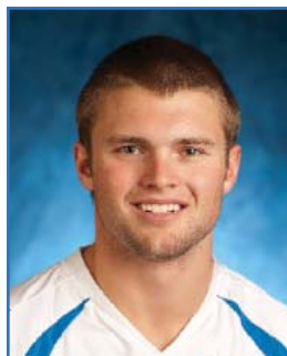
Career Highs Points: 12.0 Kills: 10 Blocks: 3 Digs: 6 Aces: 2